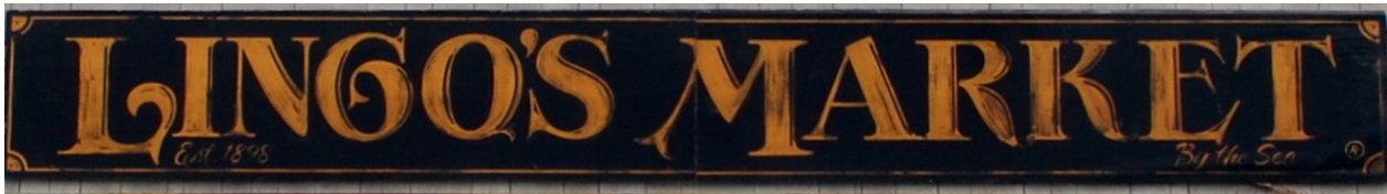
"Lingo's Market" sign as it appeared when operated by Archie

wall of the building that Lingo's Market once occupied. In both their current and previous forms, the signs span the majority of the width of the wall to which they are affixed, and contain the words "Lingo's Market" in large gold lettering. In their current form, the words "The Original" appear in small font in the upper left hand corner of the sign, integrated into the gold trim. Similarly, the words "Dinah H. Lingo, Sole Proprietor" appear in the bottom right hand corner of the current signs. A picture of both signs is found below: