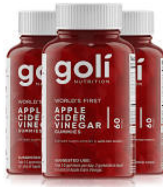
Defendant’s Product (D.I. 31-1 Ex. E)