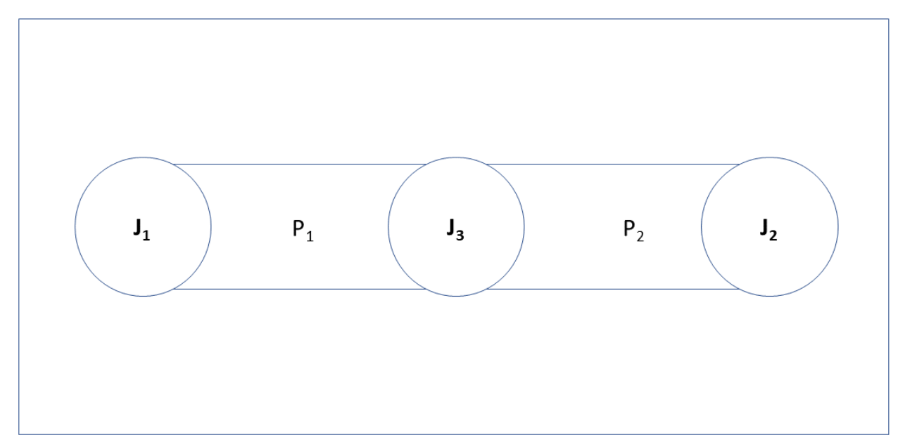
Fig. A: Representing a modeled pipe connection. J_3 is the analyzed junction. J_1 is a junction that is connected to a second junction, J_2 , via two pipes, P_1 and P_2 , which are connected by a third junction, J_3 .

('519 Patent, col. 11:18-23). That is what Defendant's proposed construction describes: